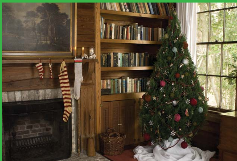
Palmyra Cottage, built circa 1840, was decorated for an early Victorian era country Christmas.

The complete Spring-Easter collection will open in Dunham Farms' on-site shops Saturdays, March 19th from 10a.m.-4 p.m. and Sunday the 20th from noon-4 p.m. Refreshments will be served. Gift shop hours will be Saturdays from 10:00 a.m. until 4:00 p.m. and Sundays from Noon until 4:00 p.m. and by special appointment.