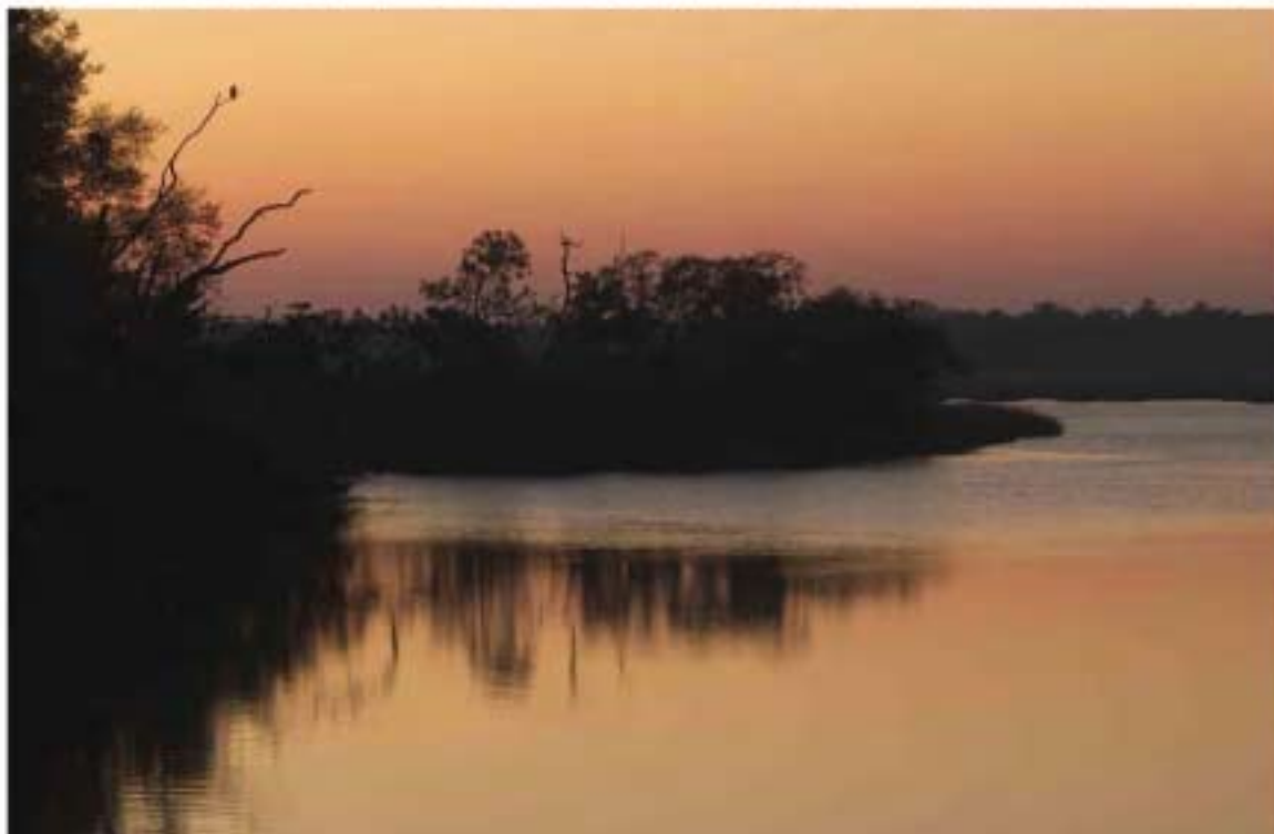
October lights the world the way it was meant to be seen. A lone osprey sits on a snag over Dickinson Creek in front of Palmyra Barn and Cottage at Dunham Farms.